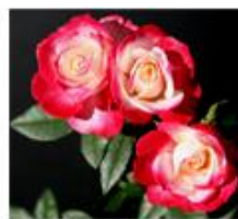
Lipstick 'n' Lace