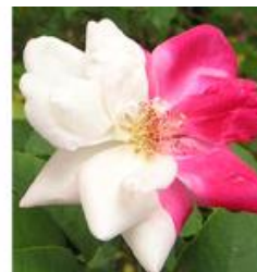
Fortune's Five-colored Rose