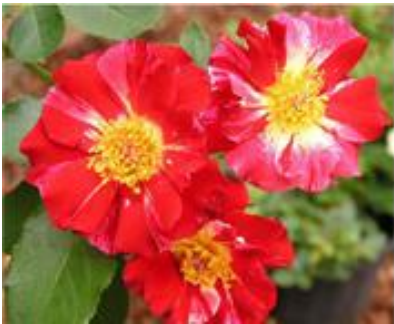
Fourth of July

Fourth of July and Clair Matin are two of the best LCl to grow in the Deep South. Night Owl is also a beautiful example of a climber, but to date, has not performed as well in my garden as the other two examples. Climbers