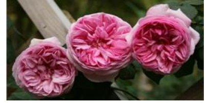
Mme Ernst Calvat

The first Bourbons were introduced in France in about 1820. Typically, Bourbons are very fragrant and tend to grow into large bushes. Souvenir de la Malmaison is a popular choice within the Bourbon class. Mme Ernst Calvat is the most fragrant variety in my garden and can be grown on a small arbor as a climber.