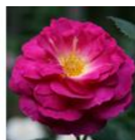
Outta the Blue