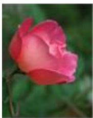
Comtesse du Cayla

China roses, originally from eastern Asia, were introduced to Europe in the late 1700s. Up until that time, all European roses bloomed only once each year.