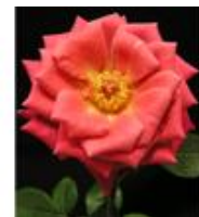
This is the Day

They make ideal container plants which can be grown as patio plants, as long as they get about 6 hours of required daily sunshine. As you can see they come in both single and double forms.