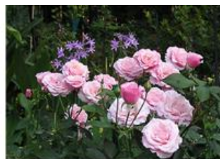
Our Lady of Guadalupe