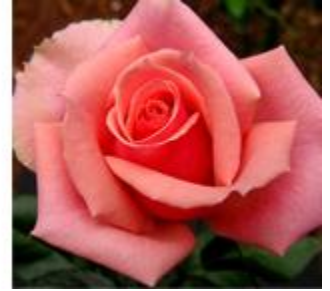
Tournament of Roses