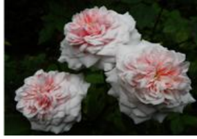
Souv de la Malmaison

Bourbon roses originated in the Indian Ocean area near Madagascar, on the Isle of Bourbon or the neighboring Isle of Mauritius.